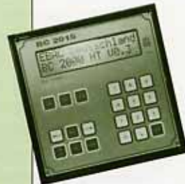
Automatic control unit BC 2015

priced and cheap to run. The average daily energy consumption is under 25 kWh. The FD 100 incorporates the latest technology including a control unit with microprocessor for maximized performance. Investment costs can be considerably reduced by do-it-yourself-work: We supply the machinery and you yourself build the drying chamber according to the instructions supplied by Ebac free of charge.