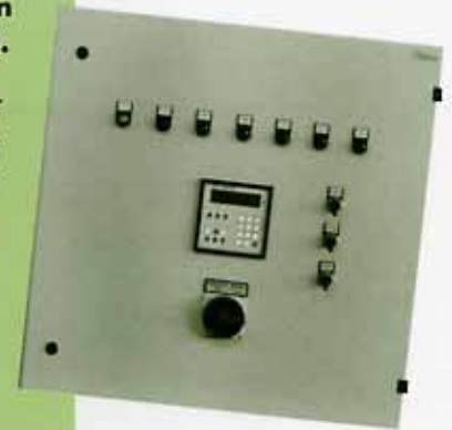
Switch cabinet with automatic control unit