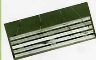
Model of a wood stack showing the arrangement of the moisture probes

series older chambers can be modernized to the latest technical standard. With Ebac help during the planning and installation phases, drying equipment can be integrated into a self-built chamber. Alternatively, Ebac can provide turn-key drying facilities to meet your requirements. Ebac drying systems offer the correct solution at reasonable cost together with a comprehensive back-up service.