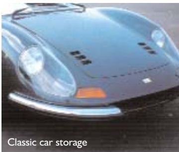
Classic car storage